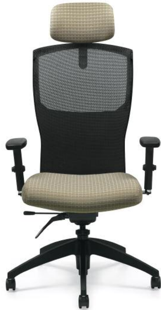
1960-2 High Back Knee-Tilter with adjustable Headrest, shown in GIG GIG1 Stone

Alero combines comfort and performance with exceptional value and design.