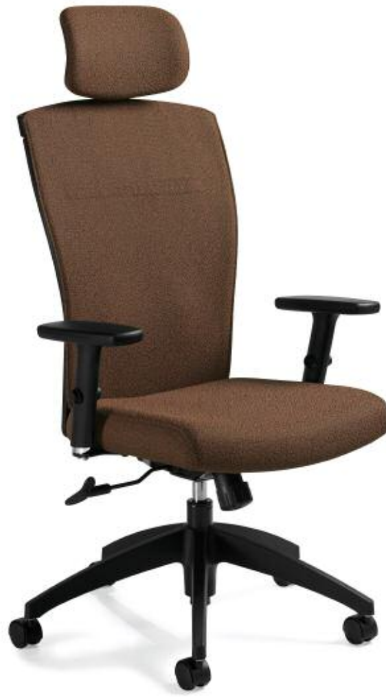
1966-2 Upholstered High Back Knee-Tilter with adjustable Headrest, shown here and on cover in Sprinkle S104 Copper